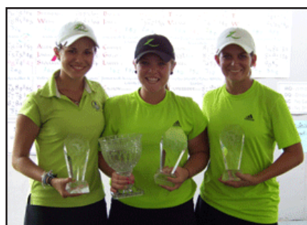
(Right) Girls 16-18 Age Division Winners - Ziegler Golf School