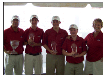
Boys 13-15 Age Division Winners - North Florida Junior Golf Foundation