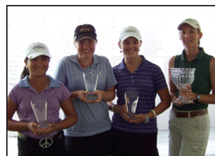
(Right) Girls 13-15 Age Division Winners - Greater Tampa Junior Golf Association