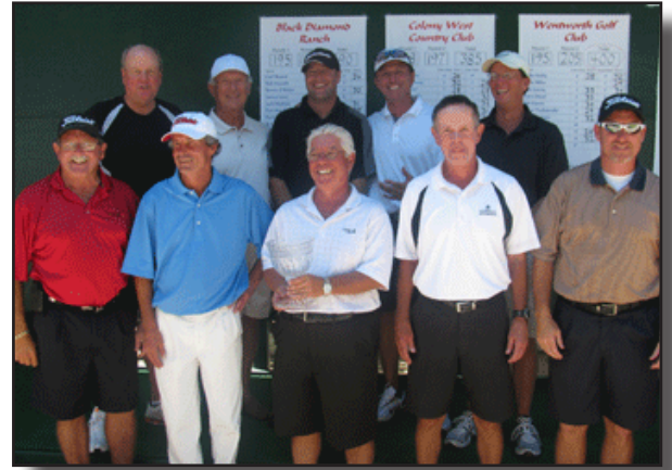
Wentworth Golf Club, 2011 Interclub Champions