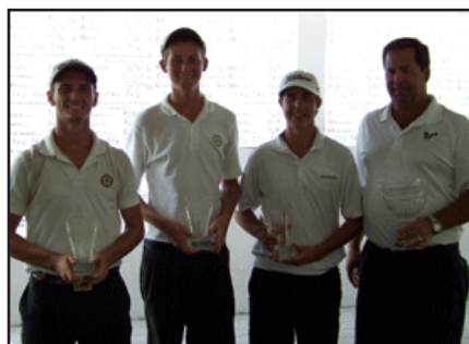
Boys 16-18 Age Division Winners - Palm Beach County Junior Golf Association